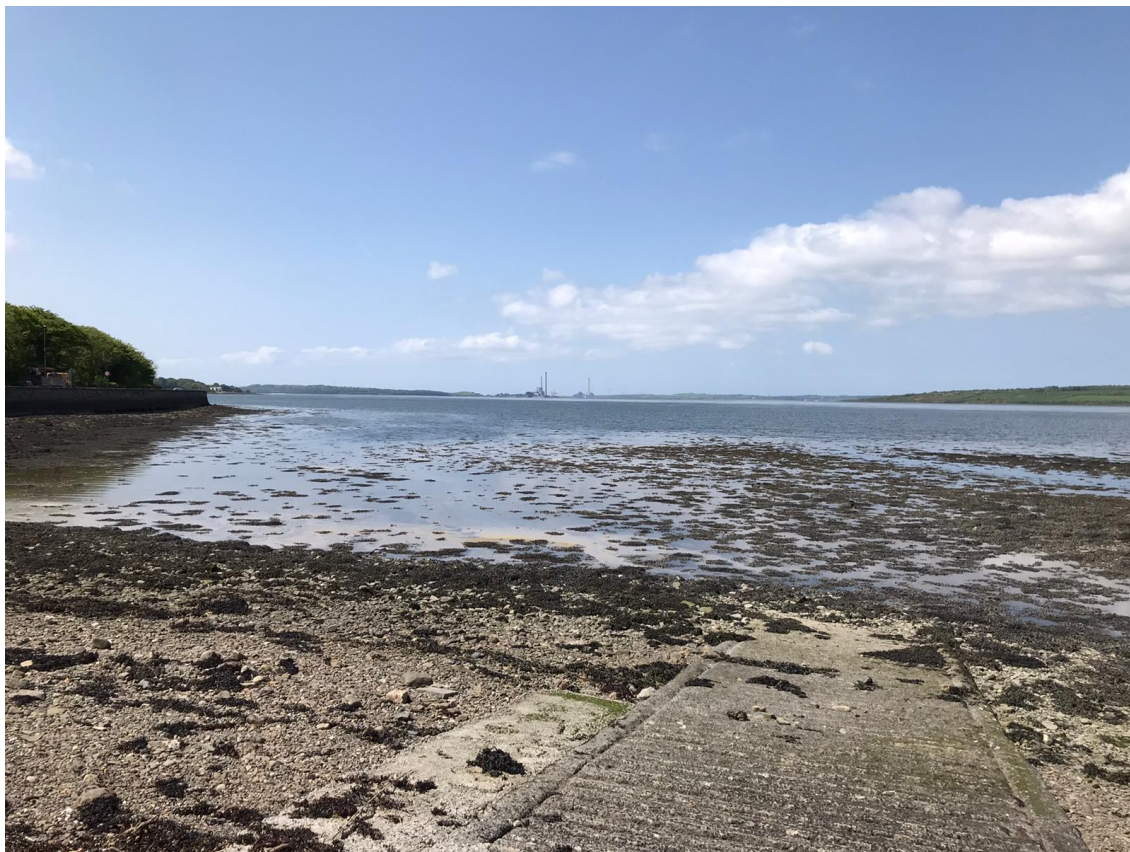
Photograph 8.17 Looking northwest at the Site from Demesne of Glin Castle and associated features ACA in County Limerick.