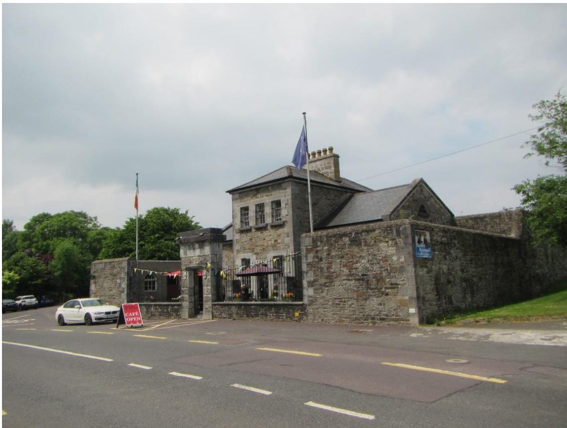
Photograph 8.10 The Protected Structure, former Bridewell (RPS-KY-0882).