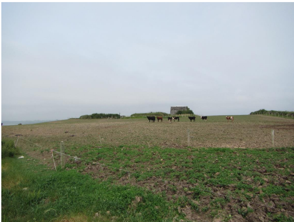
Photograph 8.21 The Protected Structure, Kilkerin Fort (RPS 345) in County Clare.