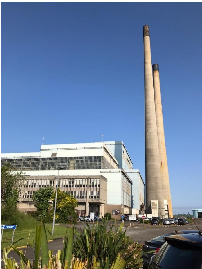
Photograph 8.3 The SSE Tarbert power station with adjacent 151m high emissions stacks.