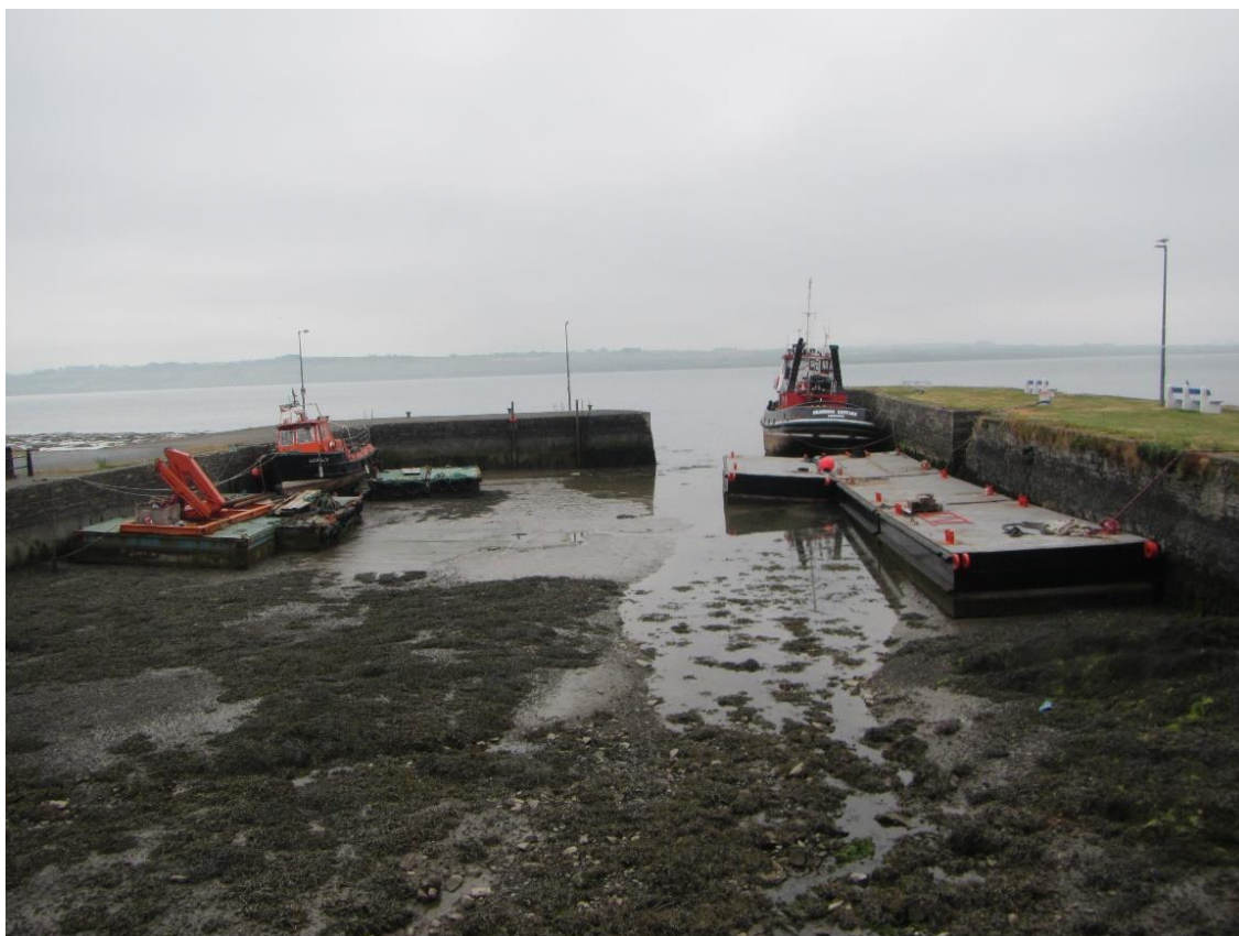
Photograph 8.20 The Protected Structure, Knock Pier (RPS 589) in County Clare.