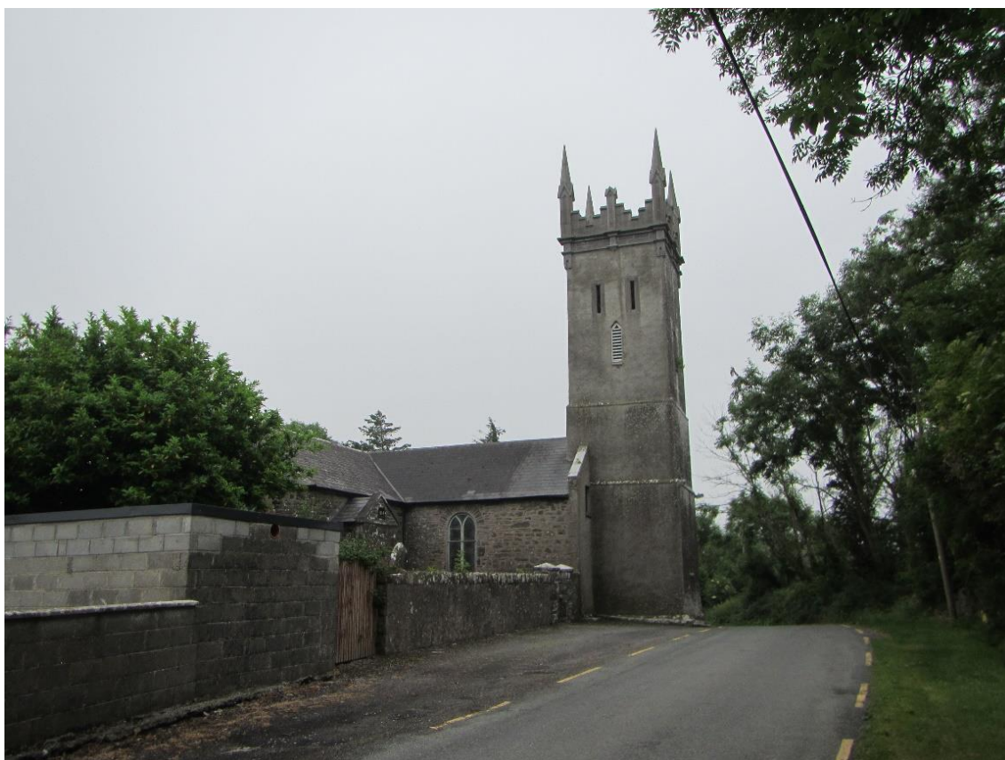
Photograph 8.16 The Protected Structure, Saint Brendan's Church (Kilnaughtin) (RPS-KY-0887).