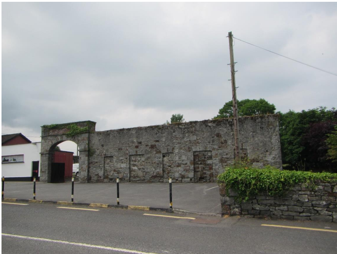
Photograph 8.11 The Protected Structure, former industrial building (RPS-KY-0878).