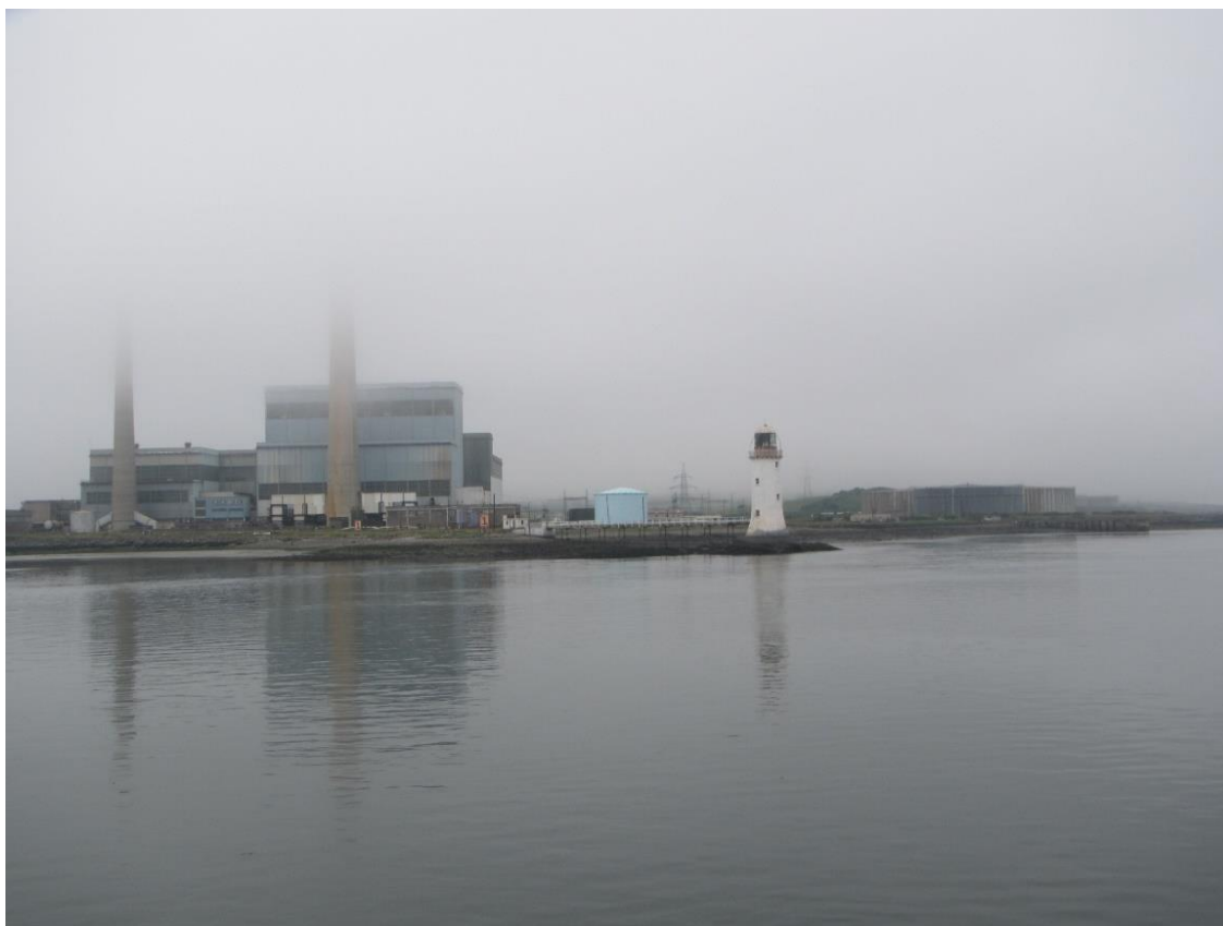
Photograph 8.1 Proposed Location of OCGT on northwest corner of the existing main building.