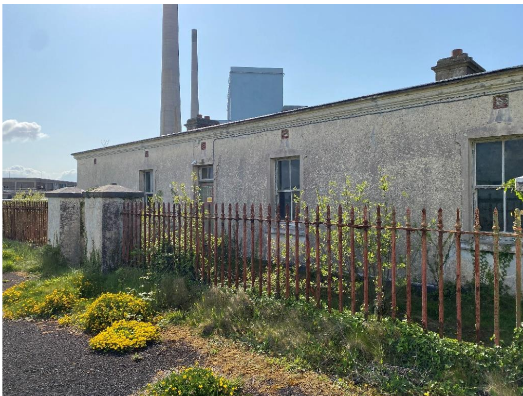
Photograph 8.4 Former light keeper's house within the SSE Tarbert site.