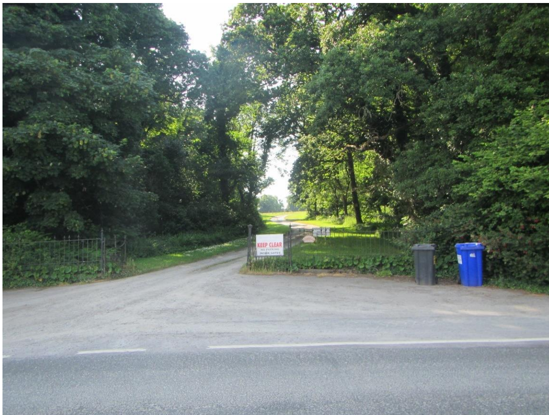
Photograph 8.7 Entrance to the avenue leading to Tarbert House (RPS-KY-0884).