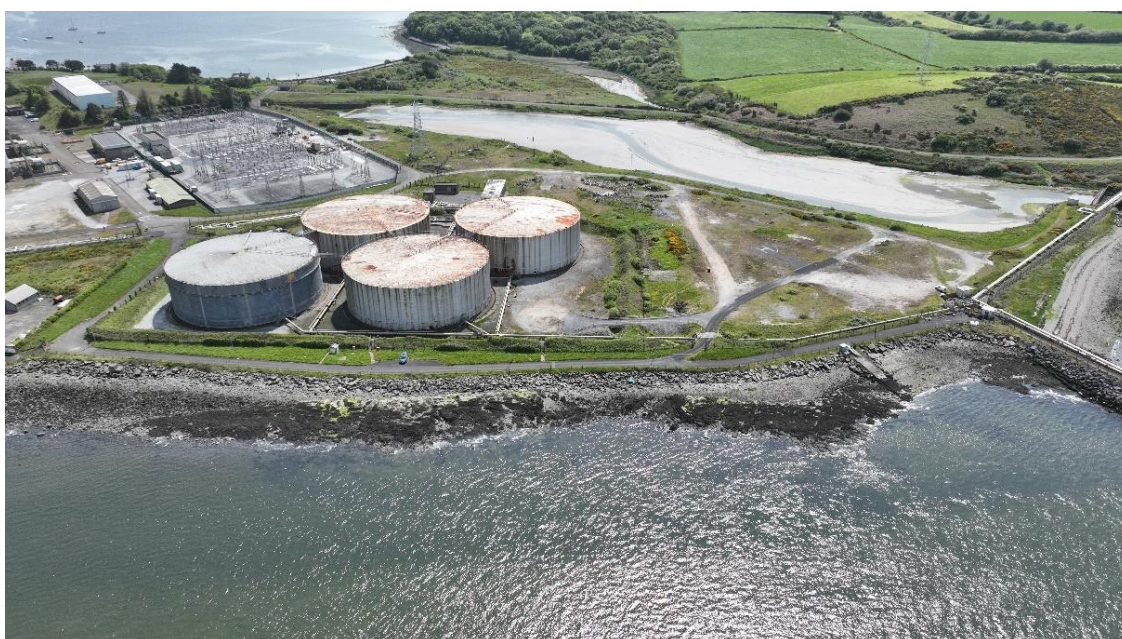
Photograph 8.2 Aerial photograph of the Site from the northwest.