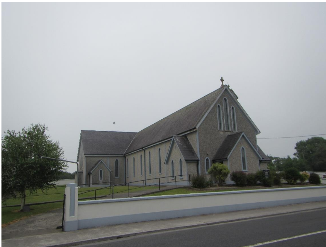
Photograph 8.14 The Protected Structure, Saint Mary's Catholic Church (RPS-KY-0886).