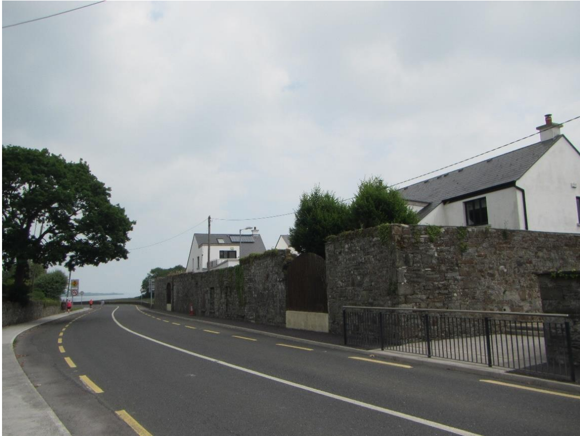
Photograph 8.9 The Protected Structure, former creamery (RPS-KY-0883).