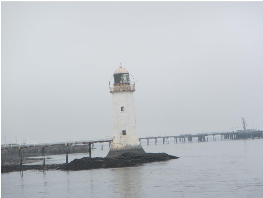
Photograph 8.5 Tarbert Lighthouse (RPS-KY-0891).