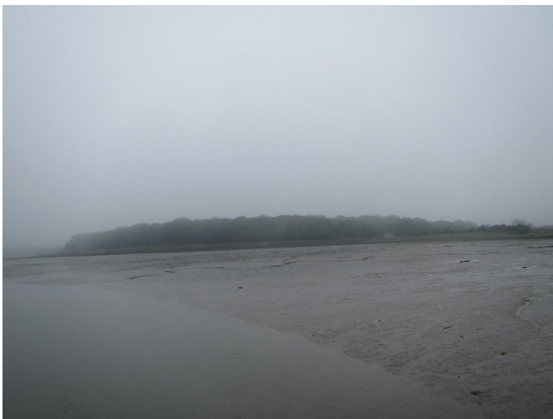
Photograph 8.6 Looking south towards Tarbert Demesne (NIAH 2051) from the ferry terminal.