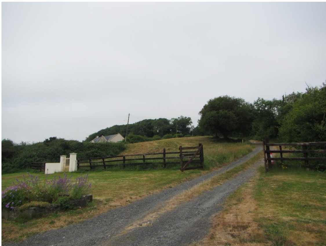
Photograph 8.19 Looking towards the location of the Protected Structure, Oaklands (RPS 036) in County Clare.