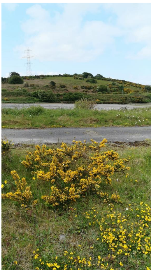
Photograph 8.8 Looking southwest from the Power Station towards the location of the bastioned fort (KE003-001).