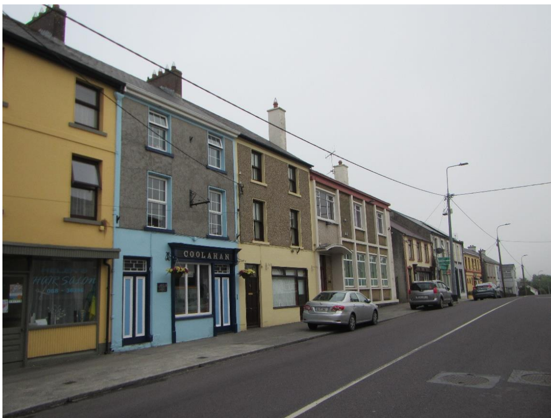
Photograph 8.12 The Protected Structure, Coolahans (RPS-KY-0879) and Tarbert ACA.