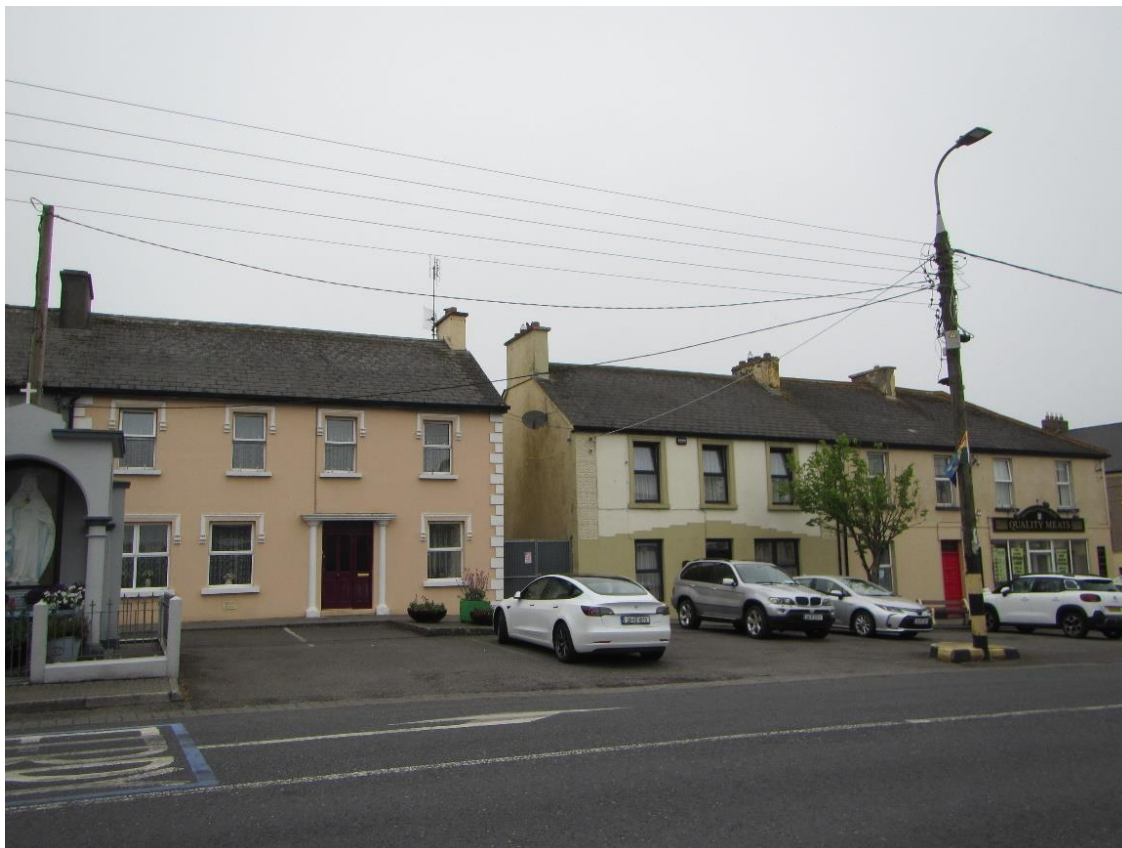
Photograph 8.13 Tarbert ACA at the Square.