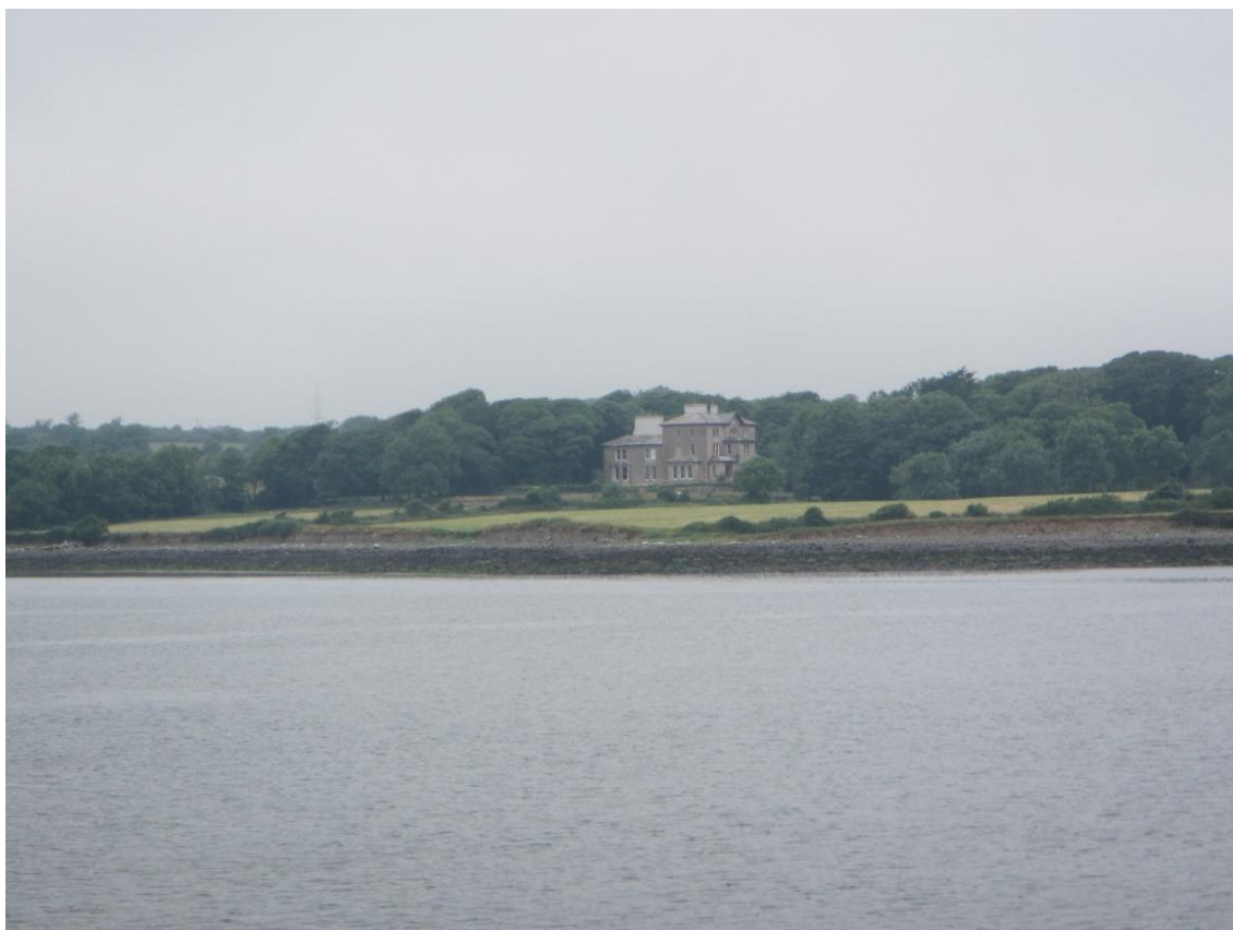
Photograph 8.18 The Protected Structure, Bessborough House (RPS 483) in County Clare.